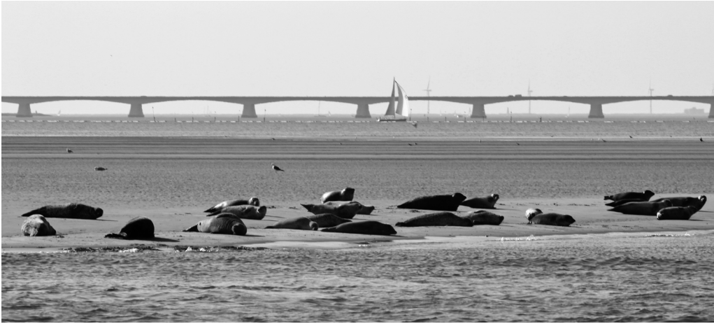
Harbour seals resting on an intertidal sand flat in the central parts of Eastern Scheldt, east of the Zeelandbrug (background), 9 September 2012.

Barriers vary from nearly open (submerged storm barrier: Nieuwe Waterweg), to semi-open (storm surge barrier, only fully closed during extreme weather: Eastern Scheldt), semi-closed (water discharging sluices: Lauwersmeer, Lake IJssel, Haringvliet, Lake Grevelingen) and nearly closed (smaller dischargers and shipping locks: Delfzijl, Harlingen, IJmuiden, Katwijk, Vlissingen, Lake Veere, Terneuzen and many smaller sluices in the Wadden Sea, the Delta waters and further inland). All barriers, even solid dams (Zeehondencrèche Lenie 't Hart 2011), are at times crossed by seals as evidenced by sightings landward of these man-made obstacles. Such sightings are often reported to internet fora, but an overview of inland records is lacking.