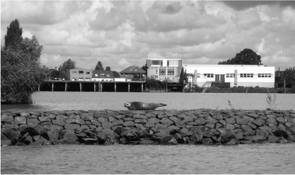
Harbour seal hauled out in Ridderkerk, River Meuse, 28 August 2010.

Wadden Sea. Clearly, more stomach contents of seals found dead in freshwater bodies are needed. Therefore, any seal found dead inland should be submitted to a full necropsy that includes a stomach content analysis, to get a full account of the prey taken by such stray animals. Similarly, the stomach content of the seals found dead in land-locked marine waters such as Lake Grevelingen and the Eastern Scheldt should be investigated to get an understanding of seal feeding habits in these estuaries. While a seal's stomach content is indicative of its last meal, other techniques are now available that would shed some light on residence times of seals found dead in inland waters. Stable isotope analysis of bone or muscle tissue would provide additional information on their feeding location over a longer time period (Jansen et al. 2012). This would be particularly relevant for seals found in the Eastern Scheldt or Lake Grevelingen, as this would show whether seals fed largely in marine, brackish or fresh water habitats.