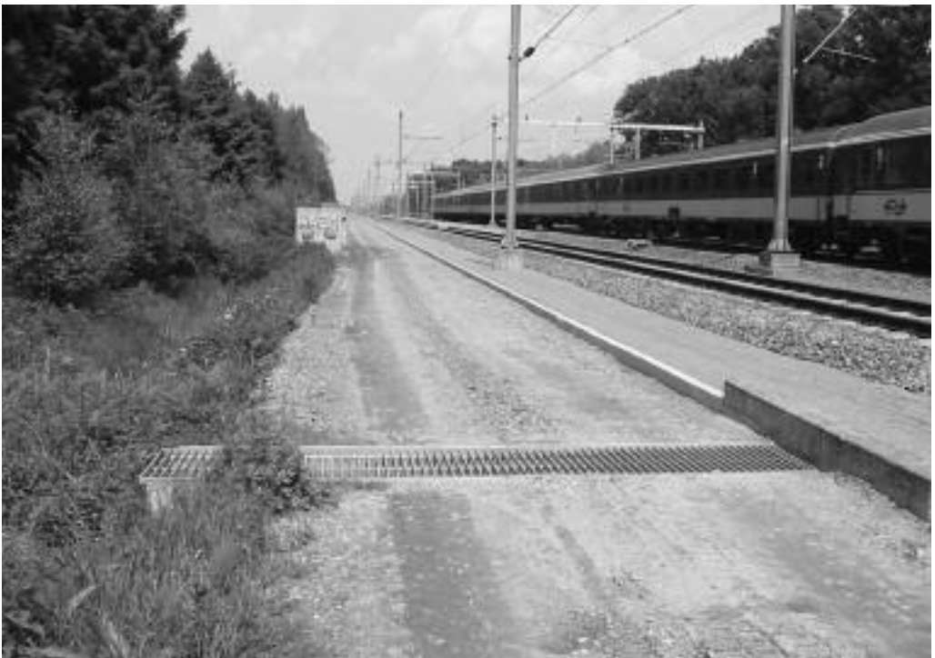
Photo 2. Grates on top of the wildlife underpasses.