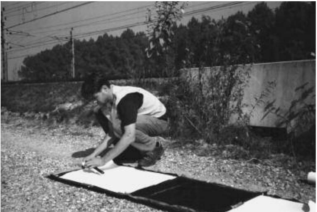
Photo 3. The two pieces of paper on the track-plates were collected and replaced after an average of eight days.

We analysed the number of crossings with a loglinear regression model, a generalised linear