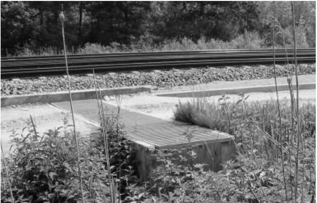
Photo 1. One of the 14 studied wildlife underpasses.