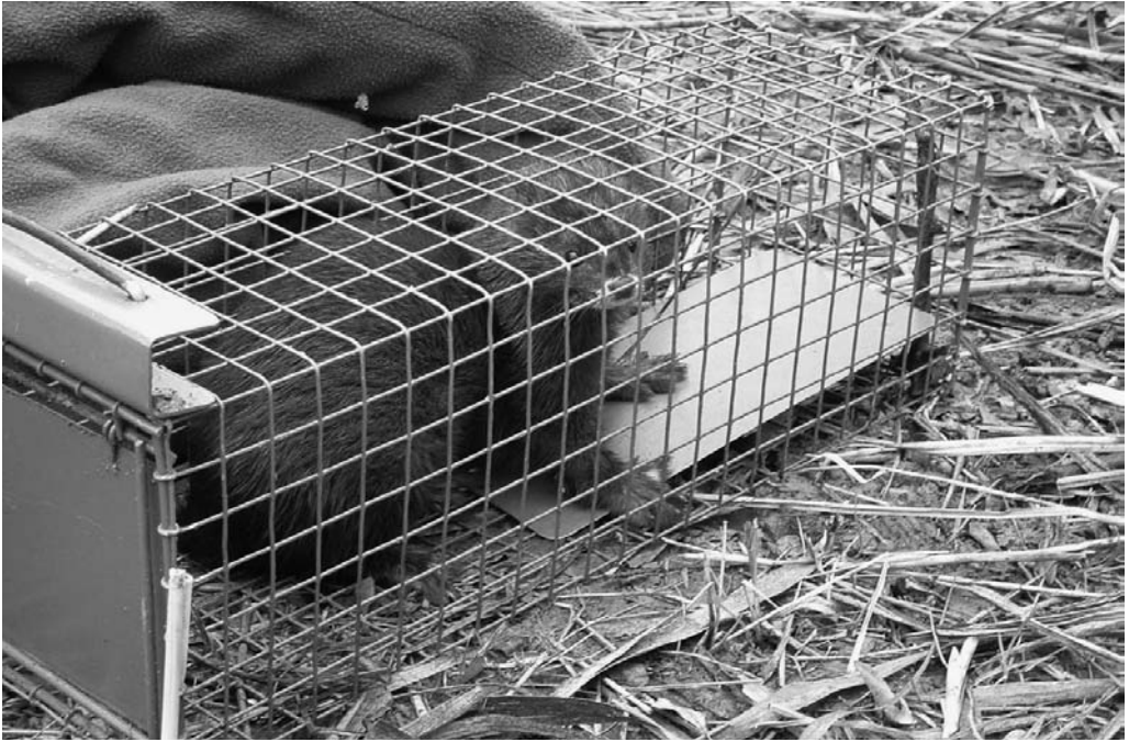
Photo 2. The second European mink in the live trap.