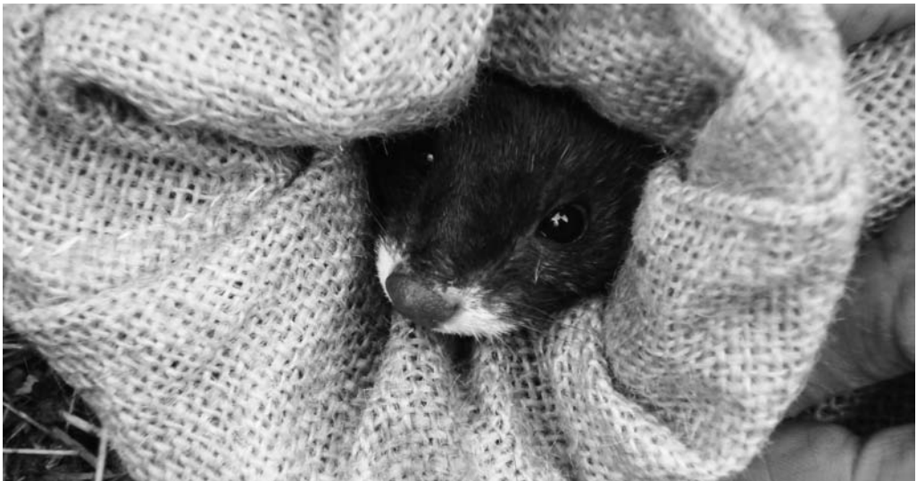
Photo 1. The European mink ( Mustela lutreola ) has a conspicuous white coloration on its upper lip and around its nose. This is absent in the American mink ( Mustela vison ).

trap two European mink in three trapping nights (1 ♀ and 1 ♂ near 45°18' N, 29°44' E; figure 1). A hair sample was taken for genetic analysis after which the animals were released. Due to