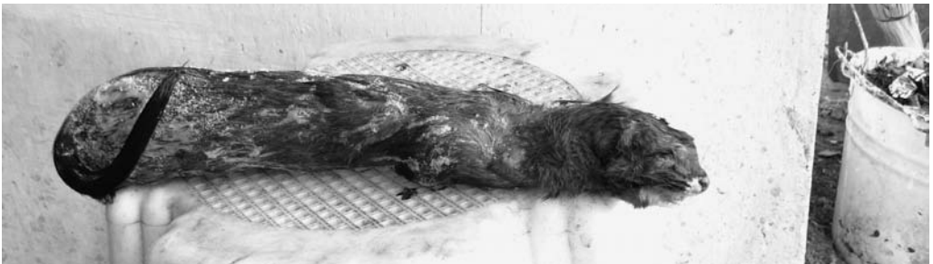
Photo 3. The frozen road victim from the Dniester delta.

Ukraine a European mink road victim was found (photo 3), indicating that a population of mink exists in that area as well.